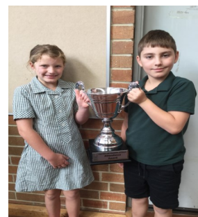
Grade 4G & 4L

Congratulations to 4G and 4L for achieving the highest attendance at Mackellar last week. Here are two very proud students from both grades with the Mackellar Attendance Cup.