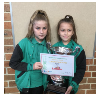
Term 2 Week 2 Grade 5G