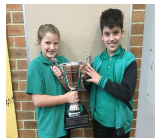
Term 2 Week 4 Grade 4G