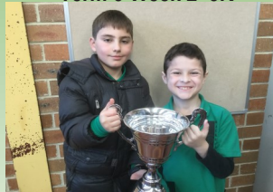
Term 3 Week 3 4L