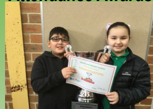
Term 3 Week 2 3K